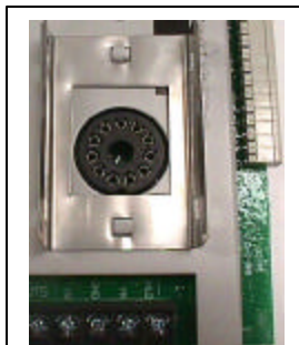
Shown mounted to MB608E